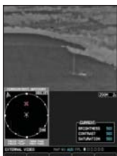
* Camera not included.