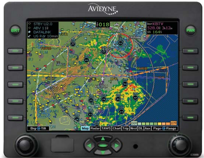
Interfaced with the MLB700, the EX600 displays Storm Track Vectors which show cell height and cell movement including speed and forecasted direction.

Internationally, the MLX770 Satellite Datalink Transceiver delivers worldwide satellite-based datalink weather and two-way text messaging for EX600 owners flying anywhere in the world. International weather products include worldwide METARs, TAFs, SAT IR, Lightning, and regionalized NEXRAD radar imagery.